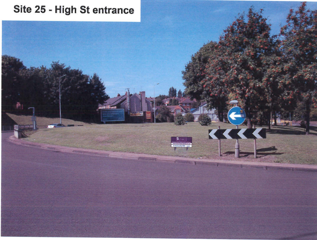
Site 25 - High St entrance

Site 25 – Stourbridge Road/High Street/Earls Way, Halesowen Propose 4 signs