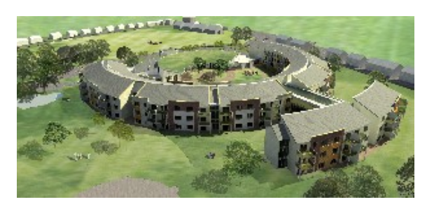
Russells Hall extra care development

A further £12m has been allocated by HCA for the remaining schemes to be built up until March 2015.