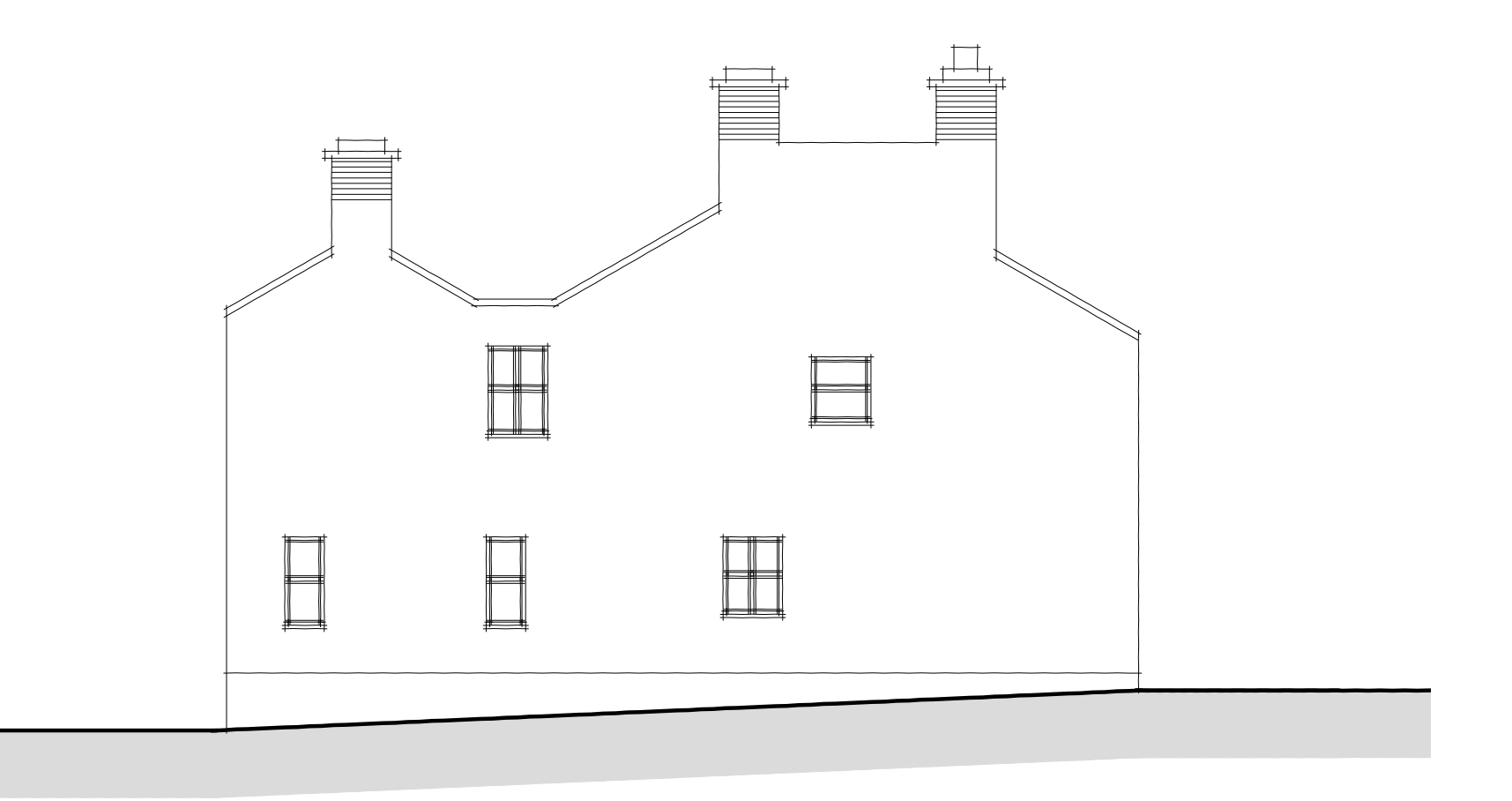
SIDE E LEVATION