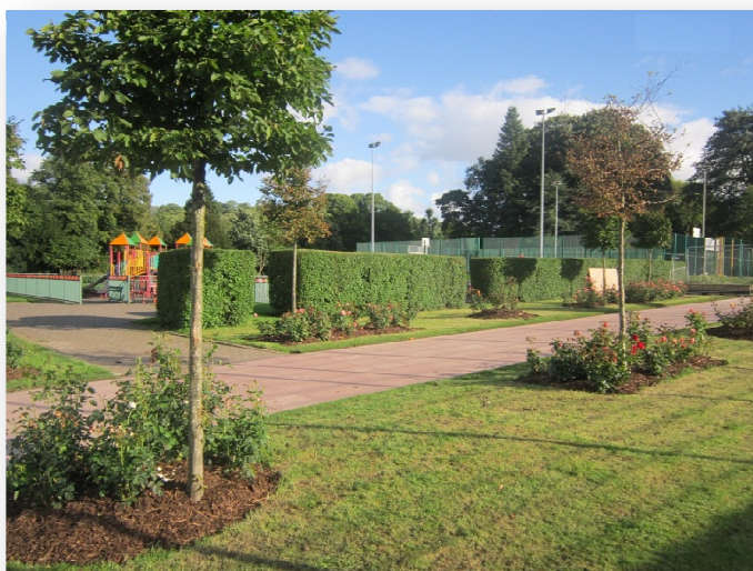
Figure 4. Priory Park, Dudley

90. Policy ENV6 ‘Open Space, Sport and Recreation’ encourages development that would increase the overall value of the open space, sport and recreation network. The provision of high quality open space to serve new residential developments and the improvement of existing open spaces is critical to the overall aims of urban renaissance and environmental transformation across the Black Country.