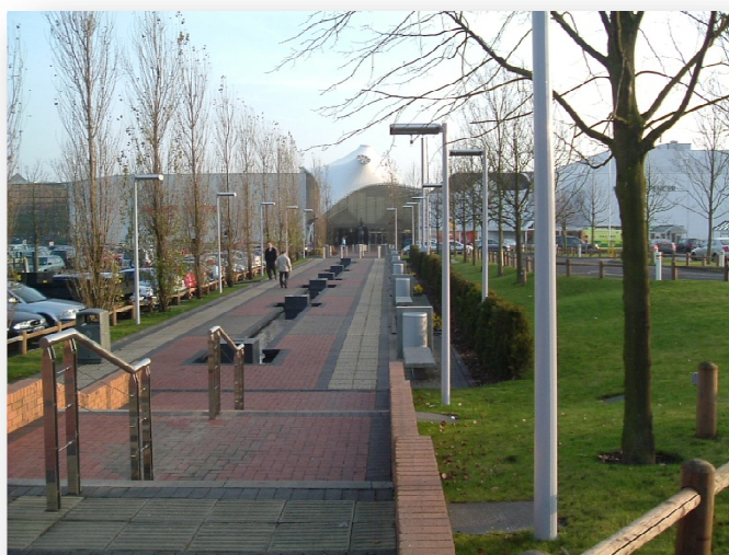
Figure 7. Merry Hill Shopping Centre.