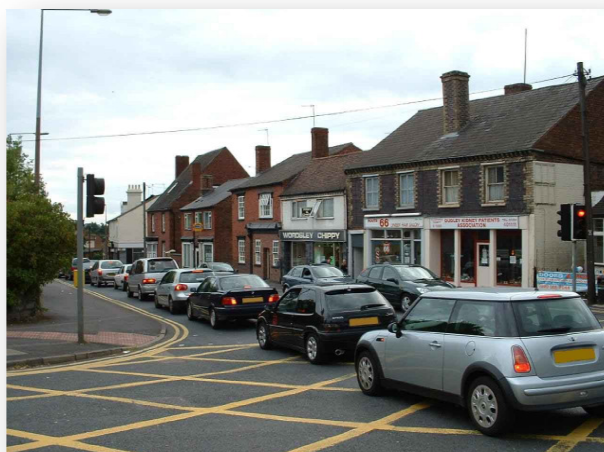
Figure 5. Traffic congestion along the A491, Wordsley