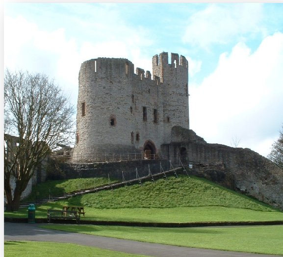
Figure 6. Dudley Castle

114. Dudley has a rich and diverse historic environment which is evident in the survival of individual historic assets and in the local character and distinctiveness of the broader landscape. To ensure that historic assets make a positive contribution towards wider economic, social and environmental regeneration, it is important that they are not considered in isolation but are conserved and enhanced within their wider context.