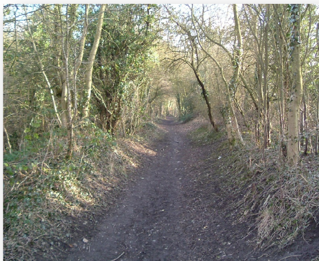
Figure 3. Wrens Nest, Dudley

83. The justification for requiring obligations with respect of Nature Conservation is set out in policies CSP1, CSP2, CSP3, CSP4 and DEL1 of the BCCS. The NPPF supports these policies which indicate that the planning system should contribute to and enhance the natural and local environment by minimising impacts on biodiversity, geodiversity and valued landscapes.