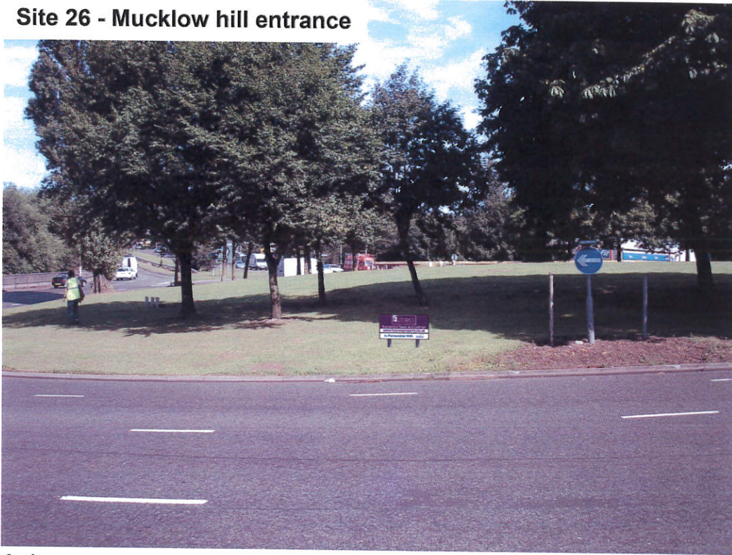
Site 26 - Mucklow hill entrance

Site 26 – Dudley Road/Mucklow Hill/Bromsgrove Street, Halesowen Propose 4 signs