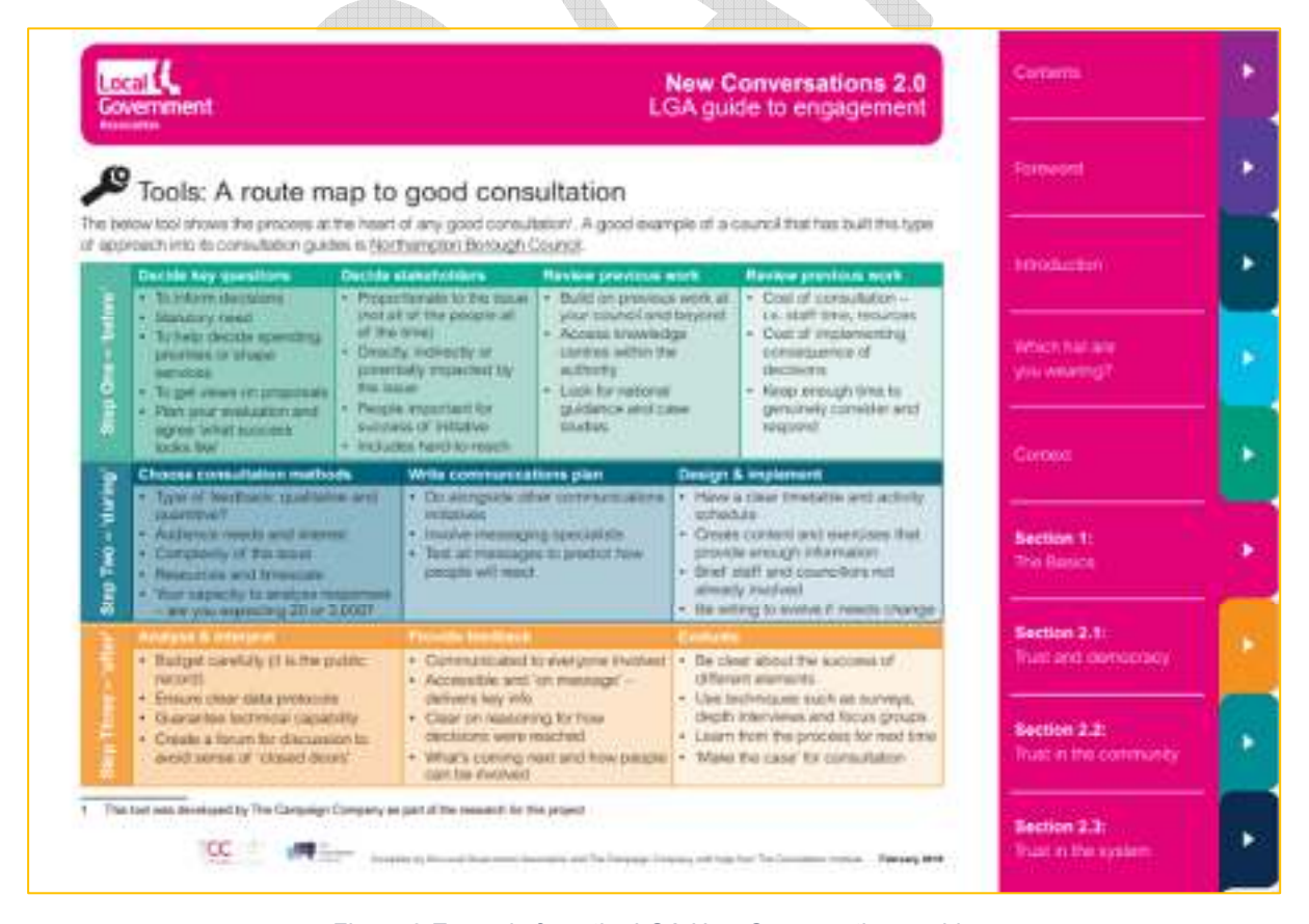
Figure 2 Example from the LGA New Conversations guide