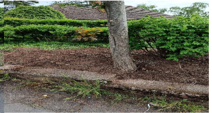
After Hand Weed