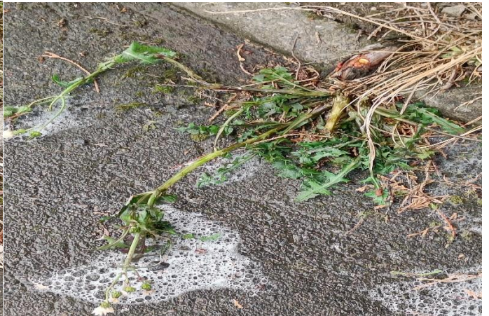
Hurst Green Open Space – 24Hrs after Treatment