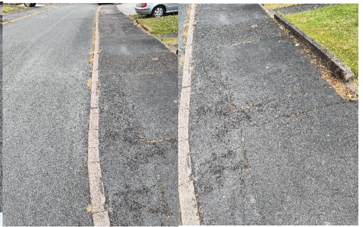
2 days after application