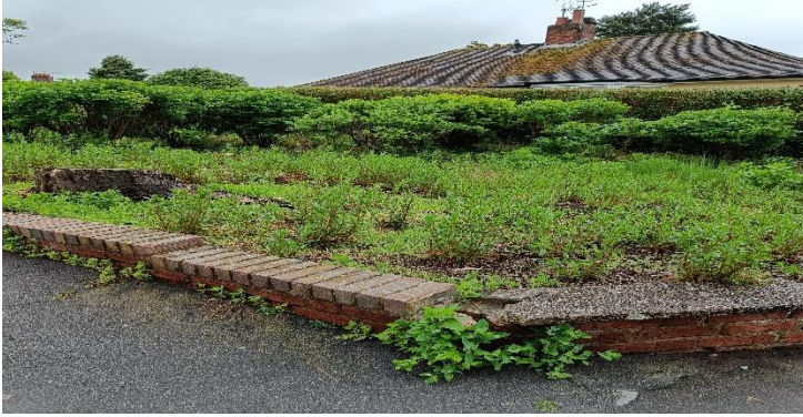
Caslon Corner – Before with Weeds