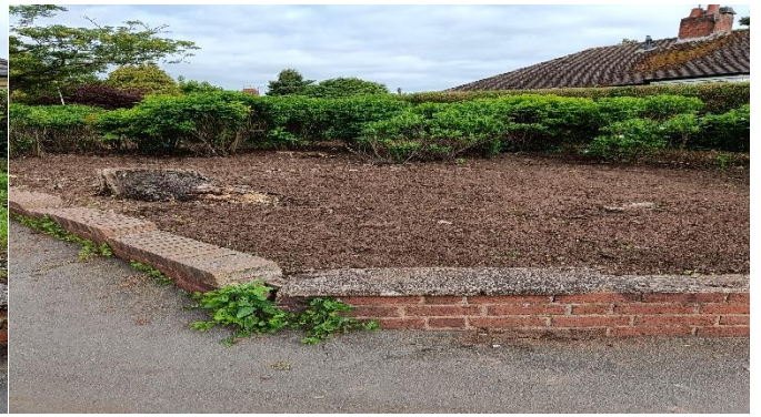
After Hand Weed