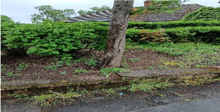
Before with Weeds