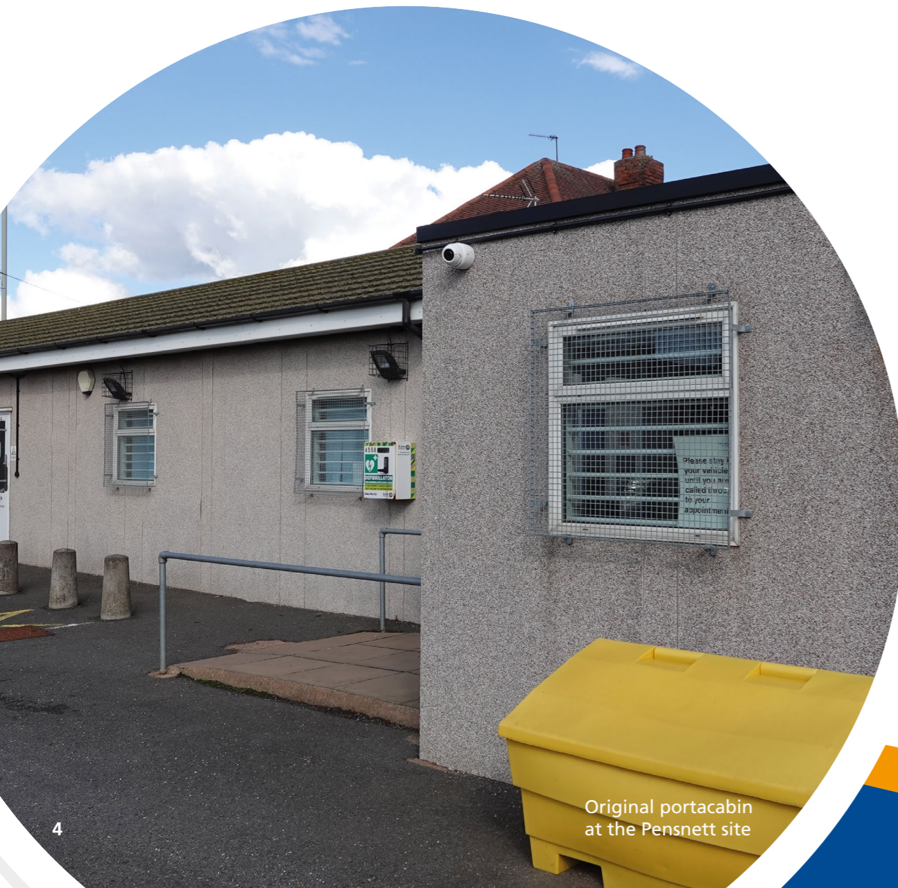
Original portacabin at the Pensnett site