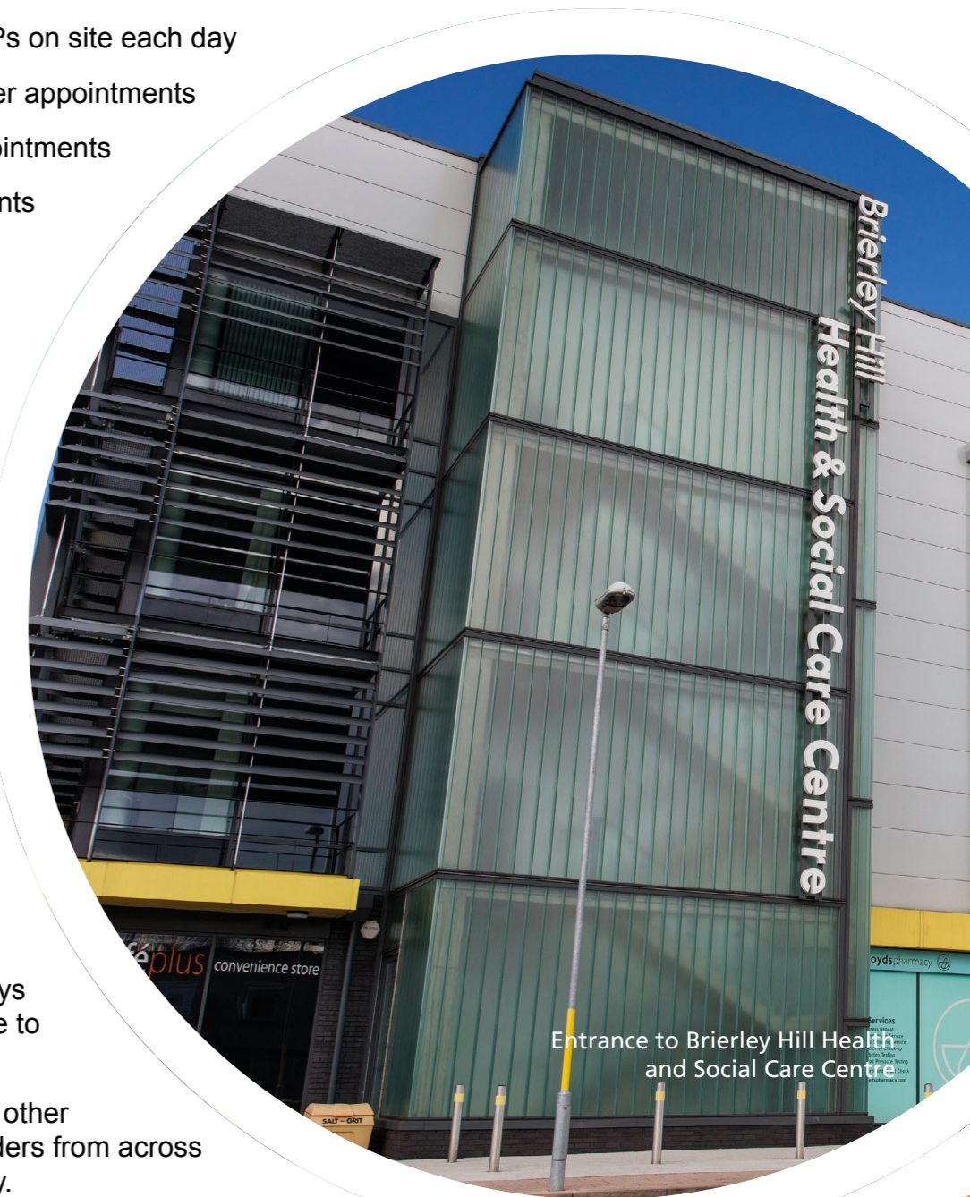
Entrance to Brierley Hill Health and Social Care Centre