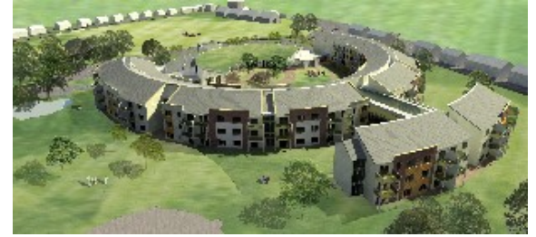
Russells Hall extra care development