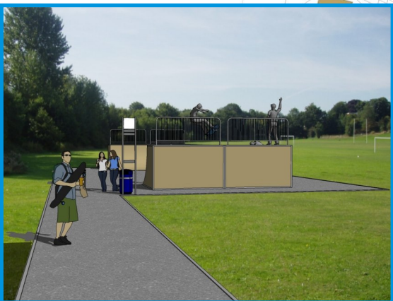
View of the skatepark and access track (Layout to be confirmed)

Please complete the enclosed questionnaire and return in the envelope provided by 16th February 2006